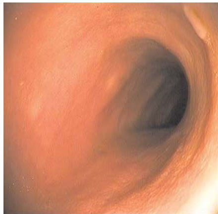
Figure 1. Duodenal mucosa of healthy dogs is smooth, shiny, moist and translucent. Endoscopic view

On X-ray examination of the duodenum in VD and LL projections using positive contrast we found disparity and spasticity of the gut lumen in all specimens, especially in 11 cases where CIBDAI \geq 9. In most cases the changes were described to be bulbar, and the metal shadow boundaries of barium sulfate with the surrounding soft tissue were corrugated, discontinuous and hazy. The surface of the mucosa was deformed due to spasm and edema, and had a marble-like appearance due to barium deposits attached to the hypertrophic mucosal folds. Due to the presence of mucus, blood and desquamated epithelium, downy flocculation (fragmentation) of the contrasting mixture on slimy layer was seen with double contours of the wall of the duodenum. The accumulation of gas in the form of transparent fields, regularly accompanied these inflammatory changes. In addition to morphological, X-ray diagnostics established functional, motor and secretion disorders of the duodenum. They are manifested by hyper peristalsis and rapid passage of contrast to the caudal