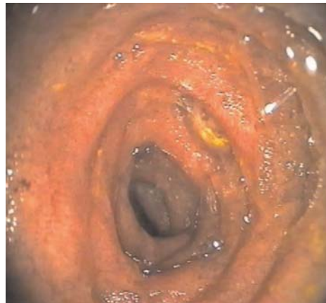
Figure 2. Duodenal mucosa of dogs with LPD is hyperaemic and edematous. Endoscopic view